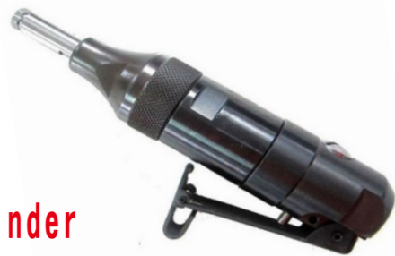
Air Die Grinder 0.2HP/150W