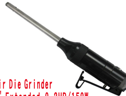
Air Die Grinder 5" Extended, 0.2HP/150W