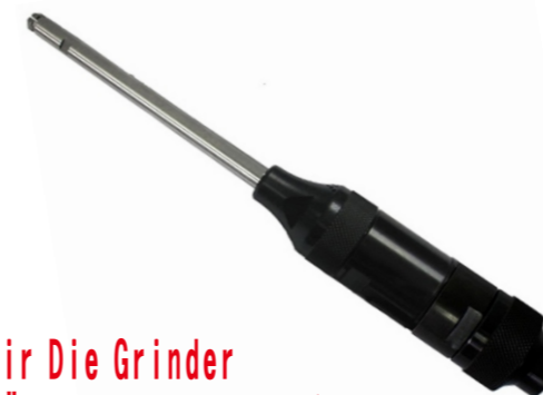
Air Die Grinder 5" Extended, 0.2HP/150W