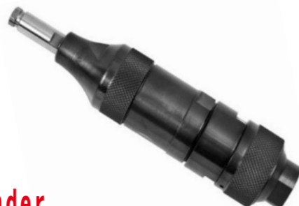
Air Die Grinder 0.2HP/150W