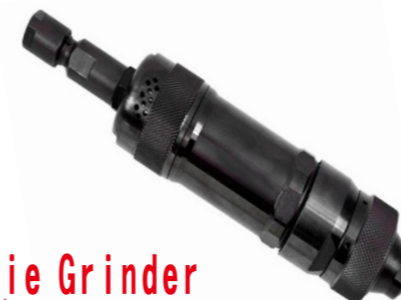
Air Die Grinder 0.4HP/298W