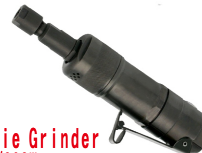
Air Die Grinder 0.4HP/298W