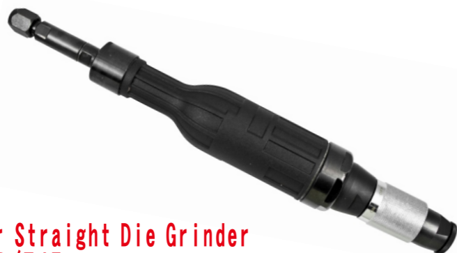
Air Straight Die Grinder 1HP/745