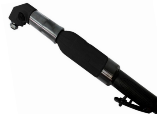
Air Straight Angle Die Grinder 1HP/745W