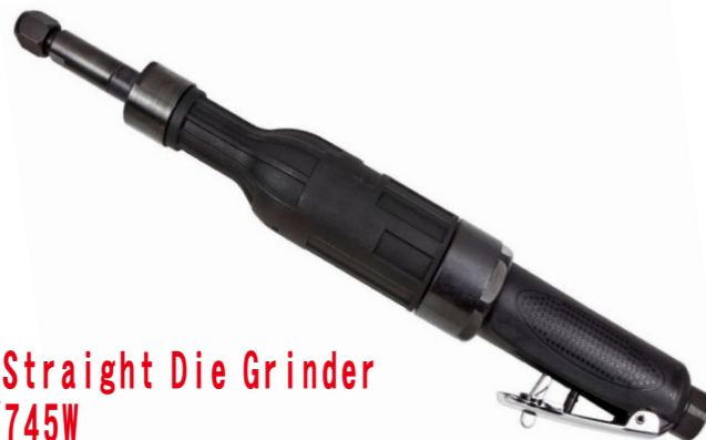
Air Straight Die Grinder 1HP/745W