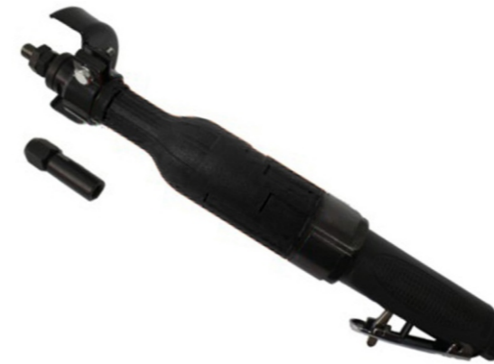
2 in 1, 3" Air Straight Grinder & Air Straight Die Grinder, 1HP/745W