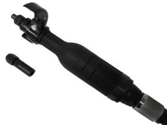
2 in 1, 3" Air Straight Grinder & Air Straight Die Grinder, 1HP/745W