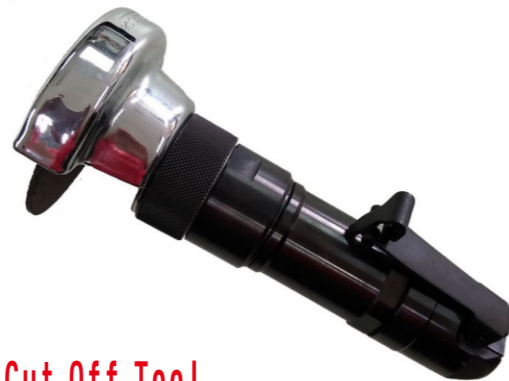
3" Air Cut Off Tool 0.5HP/373W