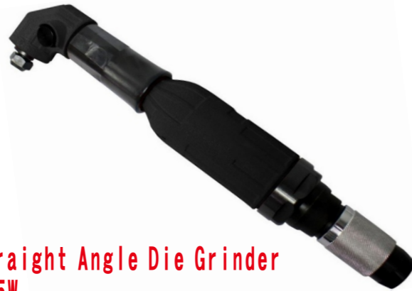
Air Straight Angle Die Grinder 1HP/745W