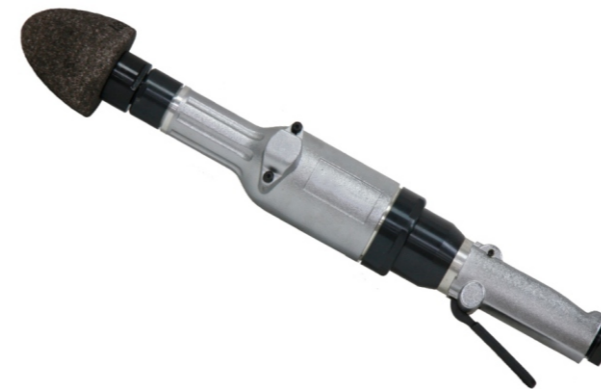
Air Straight Cone Wheel Grinder 1.4HP/1,043W