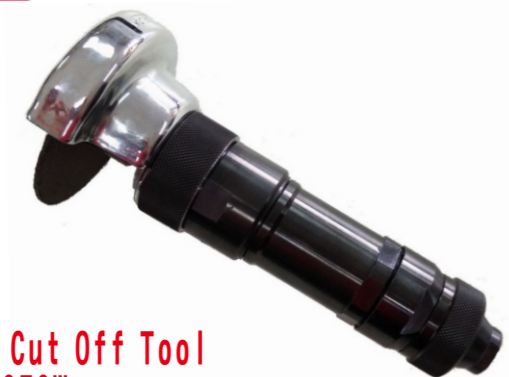
3" Air Cut Off Tool 0.5HP/373W