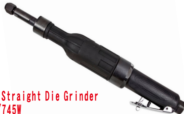
Air Straight Die Grinder 1HP/745W