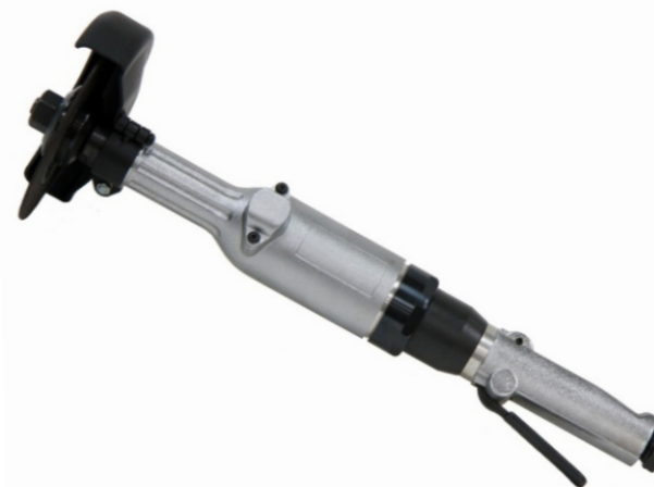
6" Air Straight Cut Off Tool 1.4HP/1,043W