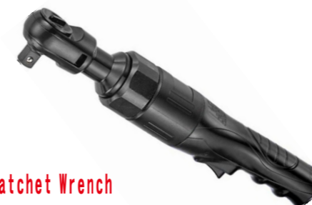
1/2" Air Ratchet Wrench