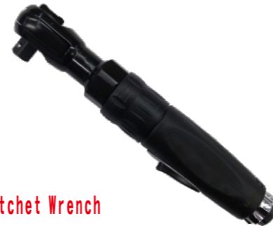
3/8" Air Ratchet Wrench