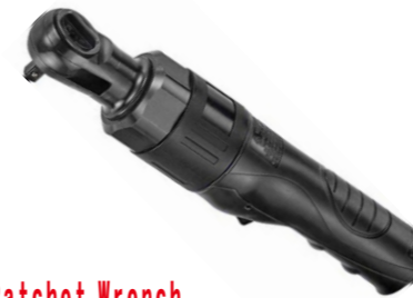
1/4" Air Ratchet Wrench