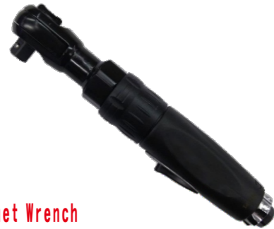
1/2" Air Ratchet Wrench