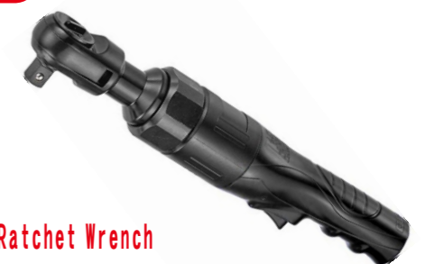
3/8" Air Ratchet Wrench