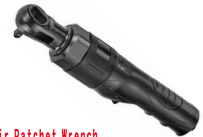
3/8" Air Ratchet Wrench