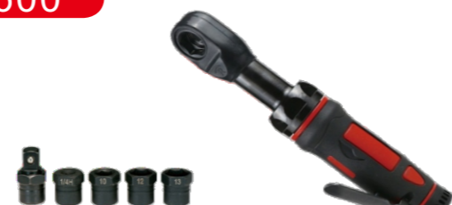
Through-Hole Air Ratchet Wrench