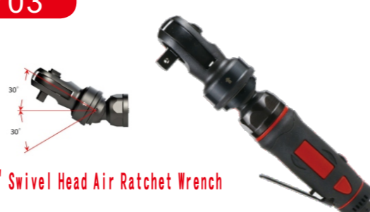
3/8" Swivel Head Air Ratchet Wrench