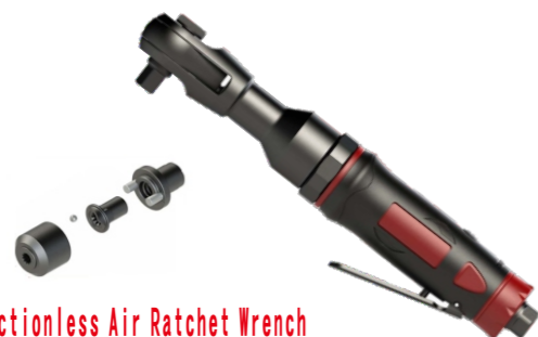
1/2" Reactionless Air Ratchet Wrench