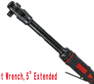
3/8" Air Ratchet Wrench, 5" Extended