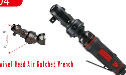
1/2" Swivel Head Air Ratchet Wrench