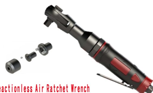
3/8" Reactionless Air Ratchet Wrench