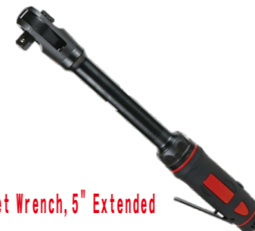
1/2" Air Ratchet Wrench, 5" Extended