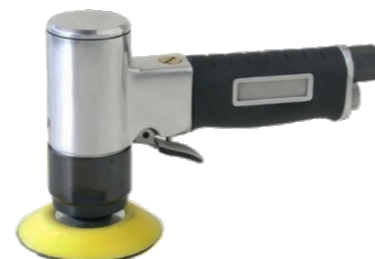
3" Air Polisher