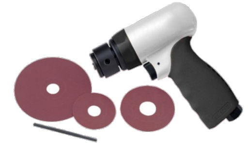
5" High Speed Air Sander