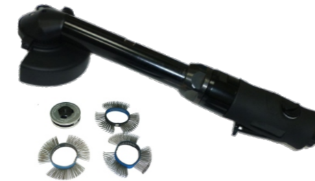
4" Extended Air Rust Removal Tool 1HP/745W