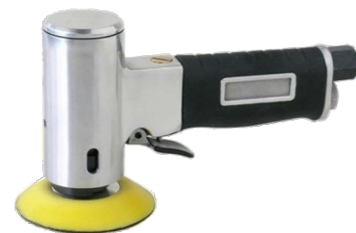
3" Air Random Orbital Sander