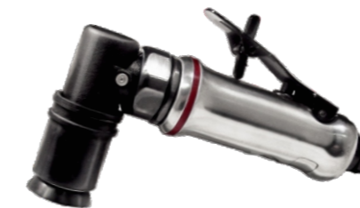
Air Angle Spot Removal Sander