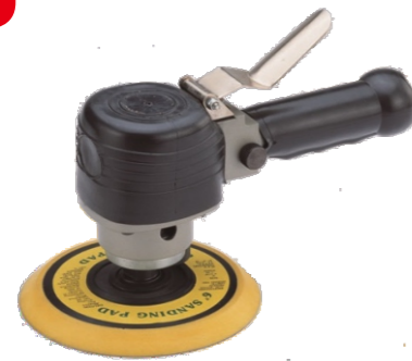
6" Air Dual Action Sander