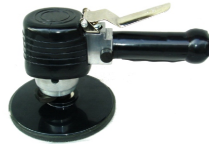
6" Air Dual Action Sander